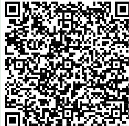
2024-2025 Thespians Points

(submit if you haven't submitted major theatre accomplishments of this year, upwards of 20 points)