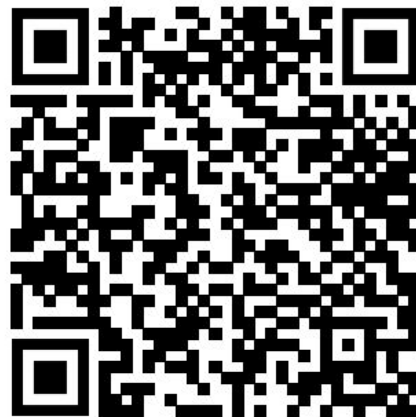
Past Years Thespians Points Form