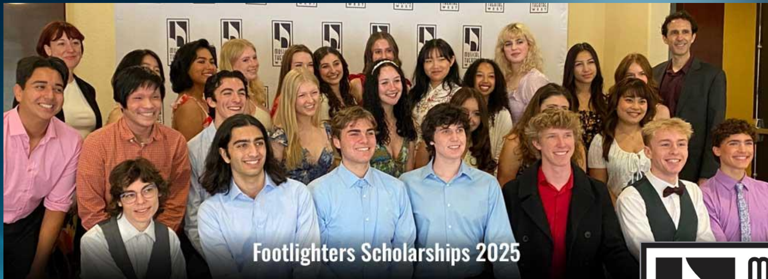
Footlighters Scholarships 2025